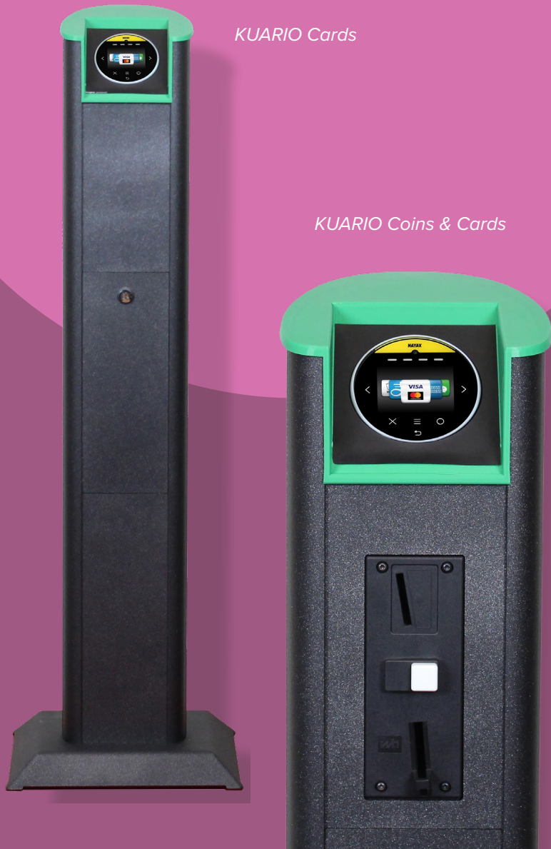
KUARIO Coins & Cards