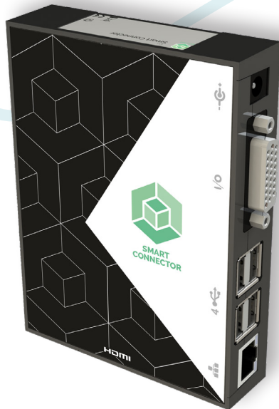
The KUARIO Smart Connector